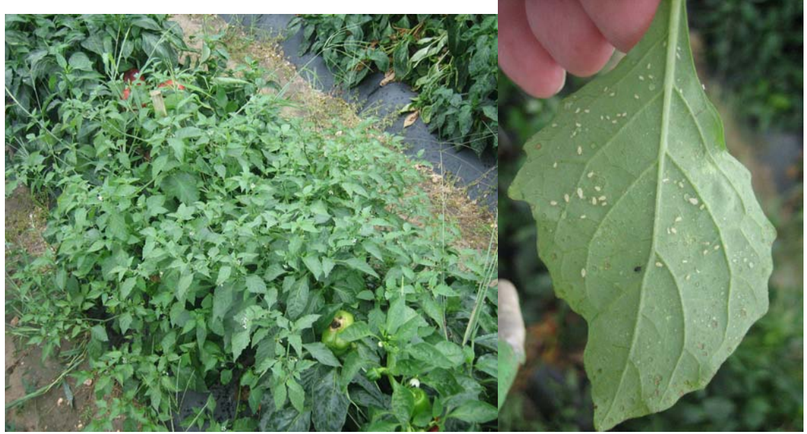
Nightshade in a row of peppers (1) and green peach aphid on the leaf underside (r).

3) In 2006, a NJ farmer was experimenting with weed control in tomatoes and initially did not apply an herbicide. A patch of eastern black nightshade supporting a vigorous