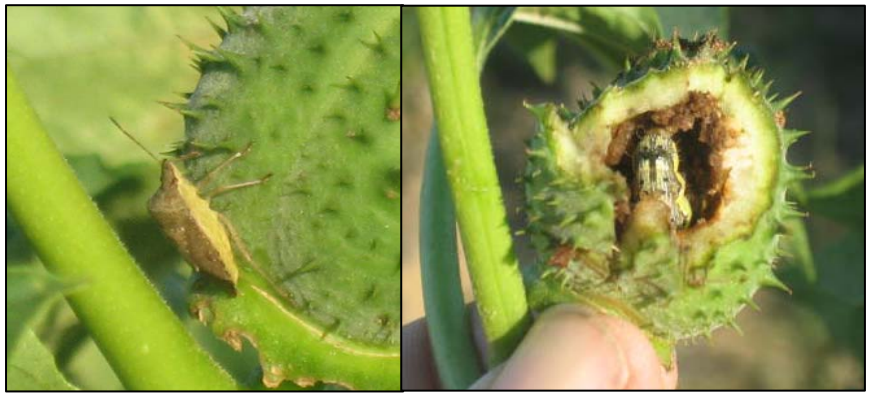
Euschistus stinkbug on a jimson weed seed pod (l) and a corn earworm larva in a seed pod (r).

1) In 2007, a patch of jimson weed growing in a field border harbored five insect pests – three species of caterpillars – corn earworm, yellow striped armyworm and tomato hornworm and two species of stinkbug – a brown stinkbug, Euschistus species, and the invasive brown marmorated stinkbug. With the exception of the brown marmorated stinkbug, all of these species were feeding and reproducing on the jimson weeds without any apparent harm to the weeds.